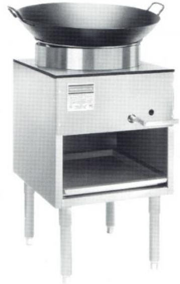
MODEL OR-18W-C (Wok not included)

HEAVY DUTY ALL WELDED BODY Heavy 1/2" Top With Stainless Steel Ring