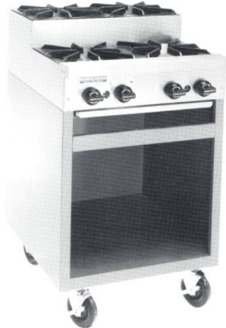
Model SUHP-424-F-C Casters are optional at additional cost.

A heavy duty open burner made in a convenient step up configuration, the perfect appliance for sauteing. This unit is furnished standard with stainless steel front, nosing, and ends.